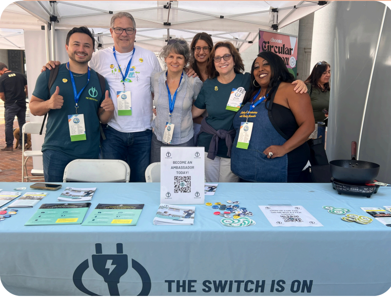
The Switch Is On Ambassadors and a BChefluencer tabling at a community event and demonstrating cooking food with a wok on induction technology, talking with and inspiring hundreds